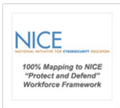
The National Initiative for Cybersecurity Education (NICE)